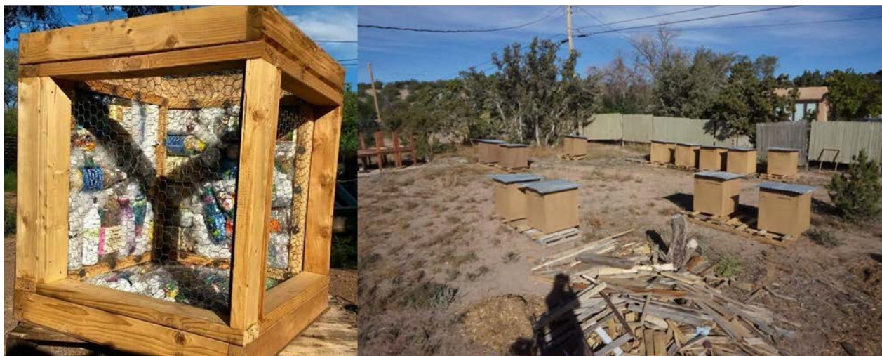
Figure 1. View of the internal construction of a test structure (left) partially completed showing framework and partially filled with recycled material as insulation. Shown on right are the final 12 completed structures on the day of sampling.

Samples were collected by filling EPA recommended Tedlar sampling bags (Sigma Aldrich, 2 liter maximum volume) with an oil-less, low flow Gast Diaphragm pump (with inert ethylene propylene diene monomer diaphragm). The sampling protocol was to insert a flexible \frac{1}{4} inch sampling tube, approximately two feet in length into the central portion of the structure volume, purge the tube volume for 1 minute with the diaphragm pump and then fill the expandable Tedlar bag to \sim 75\% maximum volume. Attached to the end of the \frac{1}{4} inch sampling tube was a K type thermocouple probe to measure the internal temperature of the structure. An infrared surface temperature scanner was also used to measure the temperature of the exterior surfaces of the structures.